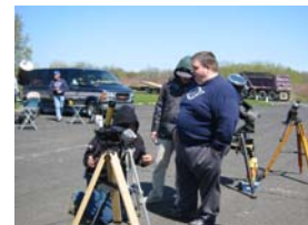
Picture from Astronomy Day