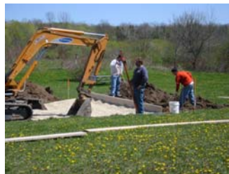
Excavation at the observatory site on May 6, 2006.