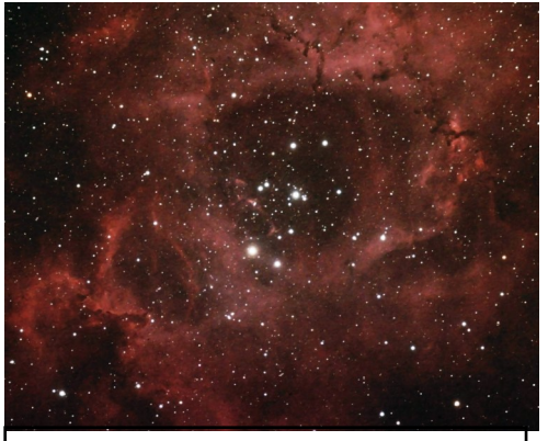
Narrow Field image of the Rosette Nebula

usky 20-inch telescope. The scope's mount is so massive that the camera rides along nearly unnoticed, mounted on a small ball head that is permanently installed near the finder. The drive is accurate enough that short exposures with a lens of this focal length do not show evidence of periodic error. The stars remain round, without the need for corrective guiding.