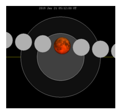
Path of the moon through the umbra, (Center circle)

The eclipse starts at about 8:36 p.m. Central standard time on January 20th, when the first hints of the eclipse will start to hit the moon. This is called the penumbral eclipse, and involves a slight darkening of the moon's surface in preparation for the rest of the total eclipse. The first portion of the partial eclipse phase will begin less than an hour later, at 9:33 p.m. The total eclipse phase will begin at 10:41 p.m..