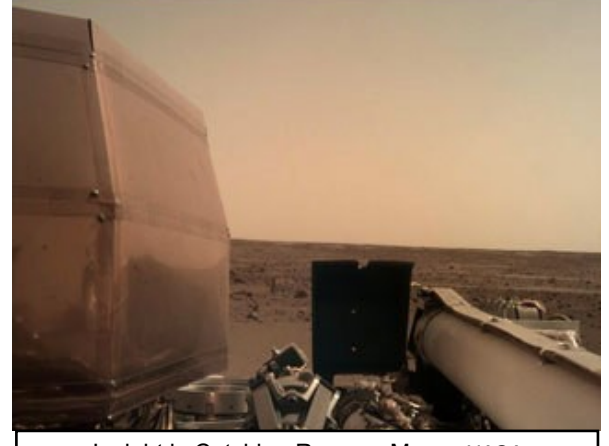
Insight is Catching Rays on Mars

The big news this week,of course, was the successful landing by 's InSight Lander, touching down on Mars on November 26th. Its complicated landing systems deployed with out a hitch, decelerating it from interplanetary velocity to a gentle landing in the Elysium Planitia region of Mars. This spot was chosen because its safe, flat terrain.