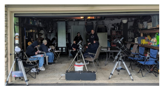
Saturday On Sunday