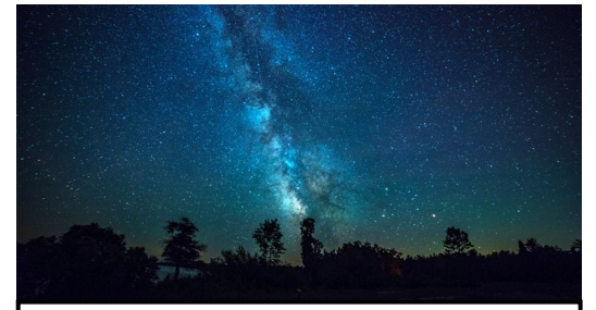
The Milky Way sets over Newport State Park, Wisconsin.

Charlotte and I were camping at Potawatomi State Park. It was Friday night with a clear sky, so we took the one hour drive, to the other end of Door County, to Newport State Park. We arrived at the designated parking lot around 10:00, and assembled the 12.5 inch dob, and attached the wheels. The paved path is marked with glow in the dark lines, which we followed to find the viewing area. There was about a four day moon, so we took the direction towards the beach, and setup so the trees blocked the Moon.