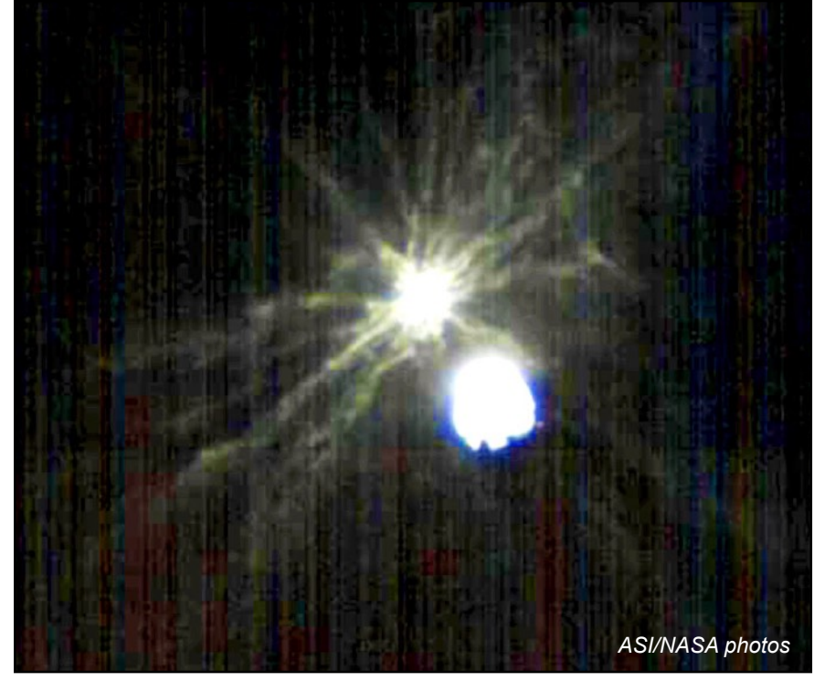
Orbit Alteration - Controllers at Johns Hopkins Applied Physics Laboratory cheer on Sept. 26 when NASA's <u>DART spacecraft</u> deliberately struck the asteroid moonlet Dimorphos. The 1,260-lb. spacecraft hit the asteroid at a speed of about 14,000 mph, shooting pictures until the moment of impact. Before the collision, the Italian cube satellite <u>LICIA</u> separated from DART spacecraft and recorded the spectacular event (right). The mission's goal was to demonstrate a viable orbit alteration technique for protecting the planet from Earth-bound asteroids. The impact was also photographed by the <u>Webb and Hubble space telescopes</u>.